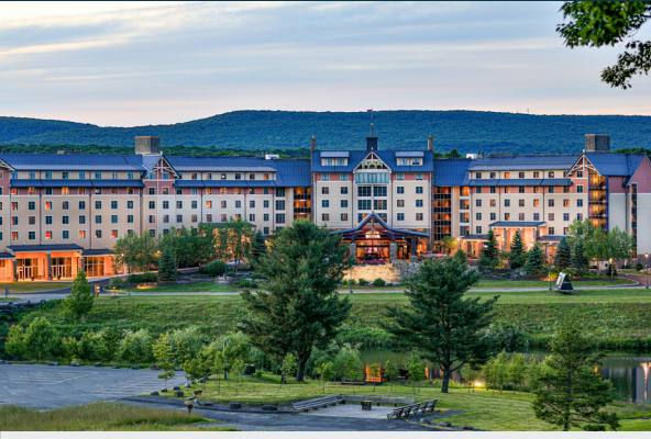
EXHIBIT ON: SATURDAY, APRIL 25