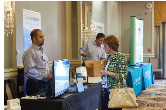
EXHIBIT APPLICATIONS ARE DUE BY MARCH 23.

*Sponsorship opportunity pricing includes fee for exhibit space at the meeting.