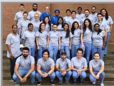
Volunteers in Erie (June 16-17, 2017) (left) Past PDA Presidents (right) Temple University dental students